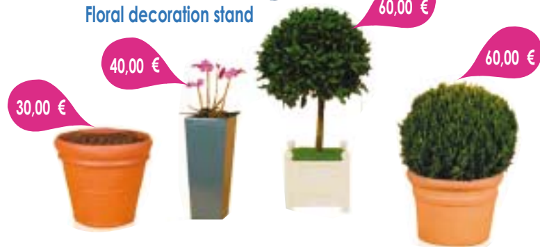
Floral decoration stand