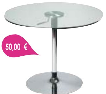
Roundtable adjustable glass H