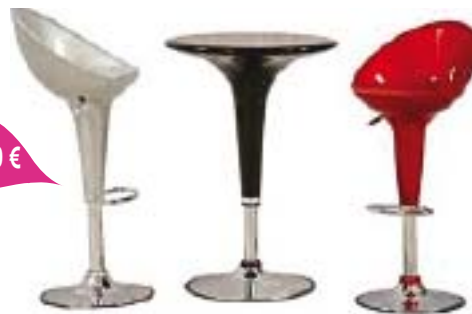
2 bar stools + table