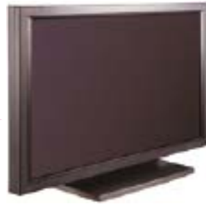
Plasma screen + DVD player