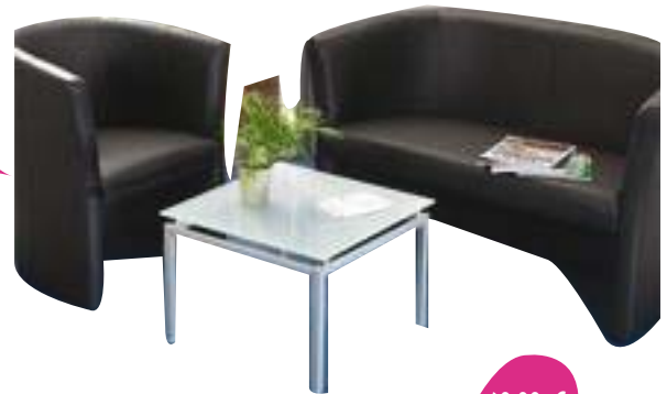
2 seater sofa + 1 place